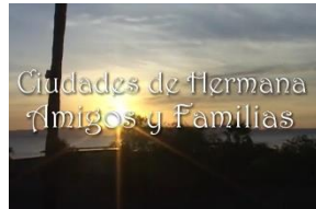
HBSCA History: 40 th Anniversary Video