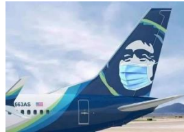
HBSCA 2020 Student Exchange Cancelled