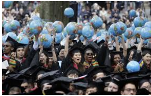
HBSCA Scholarships Awarded